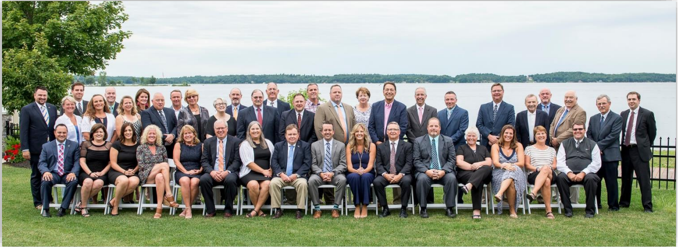
2016-2017 NYSPHSAA Central Committee, Staff and Officers